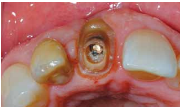
Figure 5d: Incisal view of the canal preparation, creating enough internal retention to prevent dislodgment of the provisional.