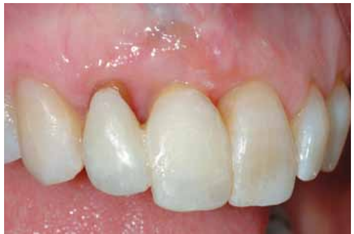
Figure 14: Provisional in place weeks after the healing of the bone graft.