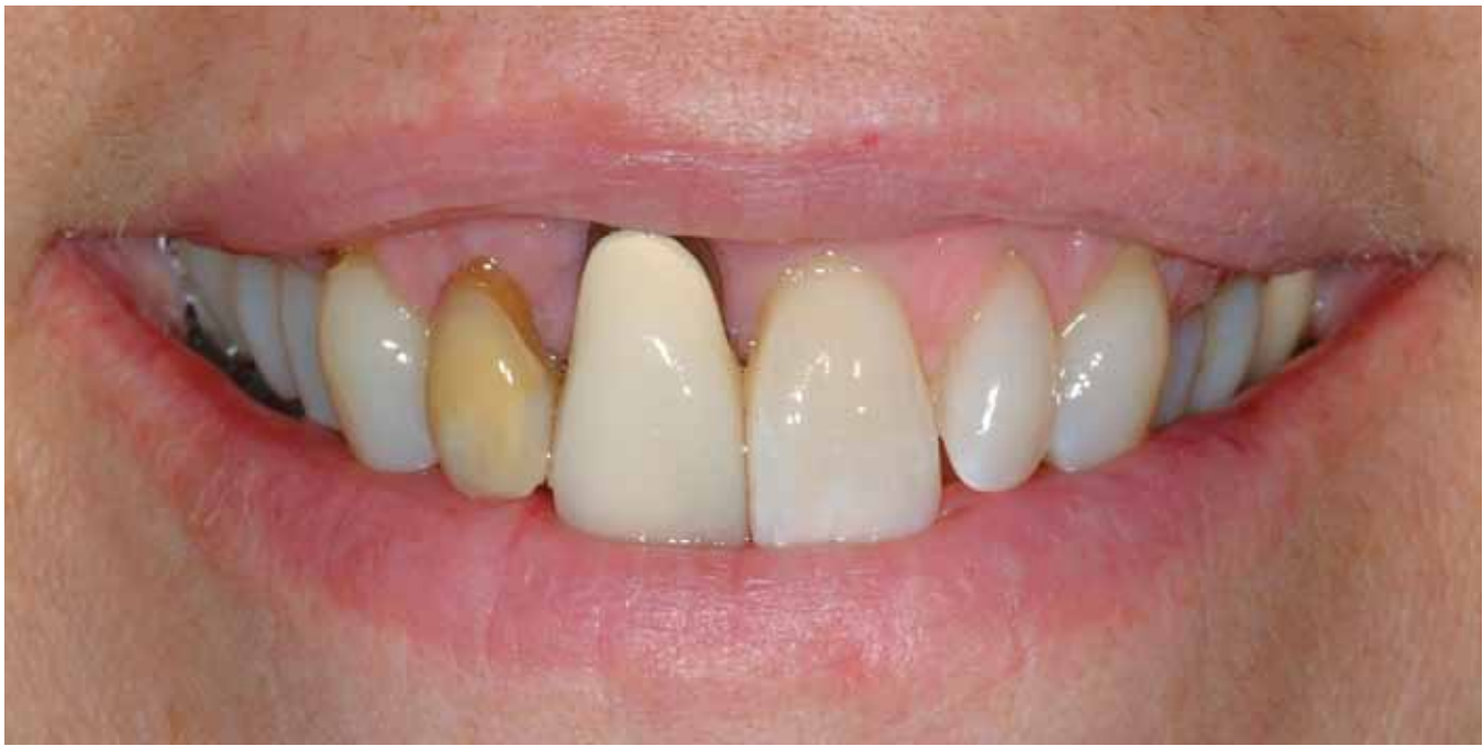
Figure 1: Image displaying the patient's high lip line. She also was unhappy with the cosmetic deformity related to her right central incisor.