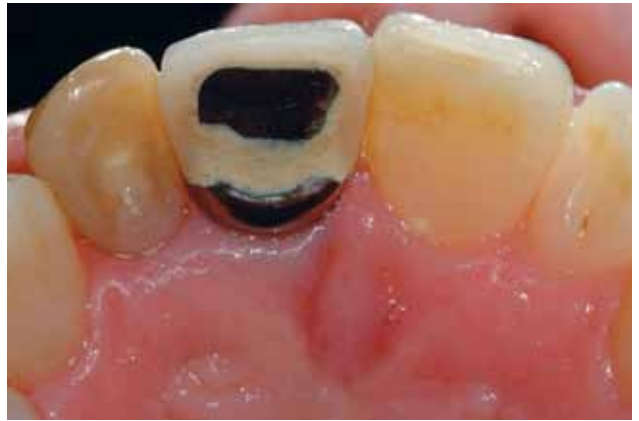
Figure 4: There was a history of aggressive occlusal adjustment on the #8 crown.