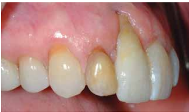
Figure 5e: Provisional restoration permanently cemented.

and soft tissue augmentation 1,2 with subsequent corrective procedures often required. A patient with a recent five-year history of bisphosphonate therapy would need to be cautioned about such an aggressive approach if a suitable option presented itself. A possible alternative, adjunctive orthodontic eruption, is often considered when the hopeless tooth in question retains a relatively intact apical fiber apparatus capable of influencing the surrounding tissue. This orthodontic therapeutic modality is well documented and has been utilized effectively to help correct restorative, periodontal as well as esthetic clinical challenges. 3-9