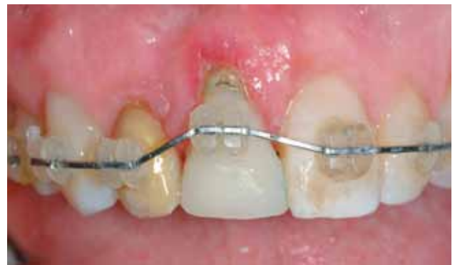
Figure 7: Modification of existing provisional to maintain original mesio-distal tooth width and form. Gingival tissues are rapidly adapting to the new tooth position.