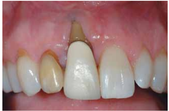
Figure 3: Advanced gum recession of 9 mm with loss of the labial bone. No attached gingivae, with the surrounding tissue extremely inflamed and exhibiting bleeding upon probing.

To accomplish this goal, reconstruction of the lost bone and soft tissue in the area of the right central incisor is a primary consideration. Myriad surgical techniques are available today that are capable of accomplishing this. To correct such an extensive defect, however, all surgical protocols would require a staged approach of multiple procedures involving both bone