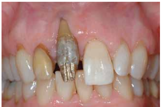
Figure 5a: Labial view of the right central incisor without the PFM crown.