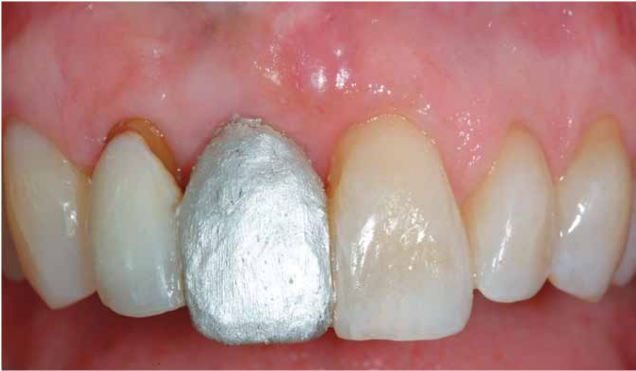
Figure 15: Colloidal silver painted over existing provisional to highlight tooth contours on the CT image.

After four months of healing, colloidal silver was painted on the provisional to have as a radiopaque reference of the outer contours of the provisional in relation to the available buccal-palatal bone. A computerized tomogram (CT) was taken to generate a digital planned surgery (Fig 15).