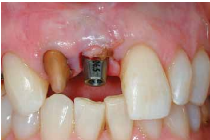
Figure 18a: Implant conservatively uncovered and stock abutment placed to support a provisional restoration.